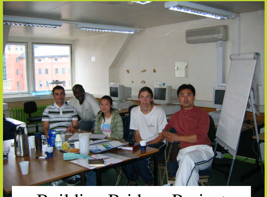
Building Bridges Project