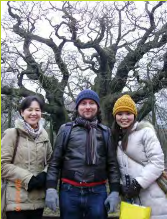
Conversation Class – Forestry Commission Trip